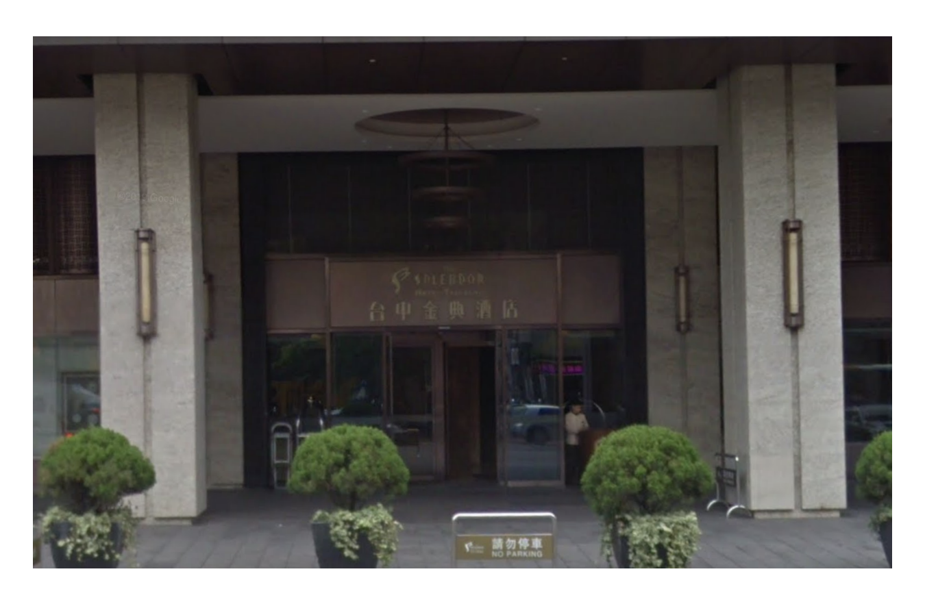
Figure \ 1: \ Meeting \ Point-Splendor \ Hotel \ Main \ Gate