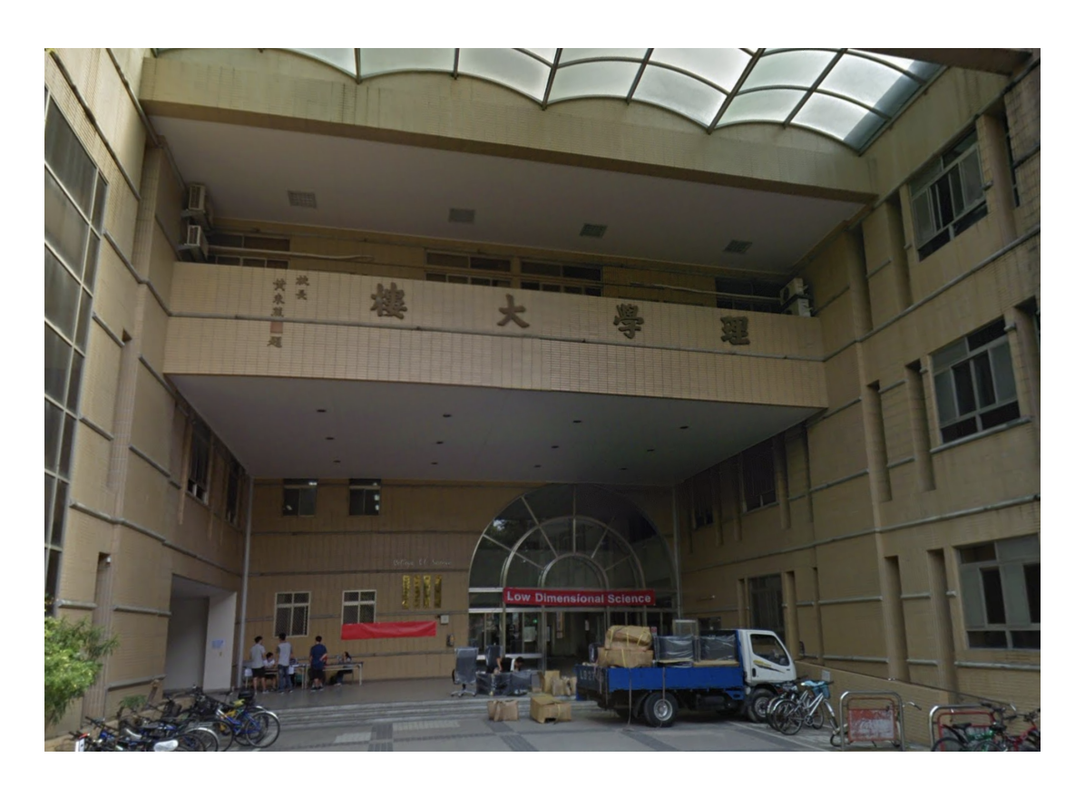
Figure 2: Meeting Point – Science College Building Main Gate