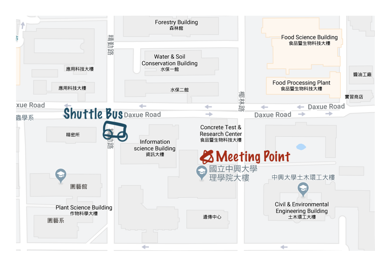
Figure 5: From the Science College Building to the shuttle bus.