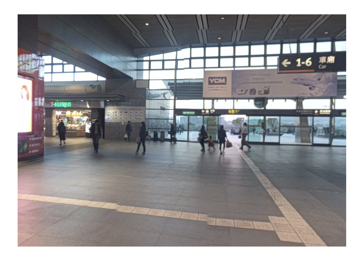
Figure 3: Meeting Point – High Speed Rail Station 4B Exit (2F)